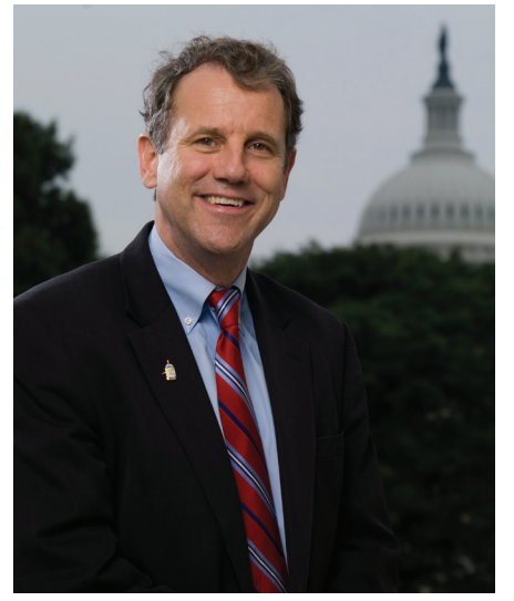
U.S. Senator Sherrod Brown (D-Ohio)

By U.S. Senator Sherrod Brown (D-Ohio) t's a basic principle: American tax dollars should go toward American-made products that support American jobs.