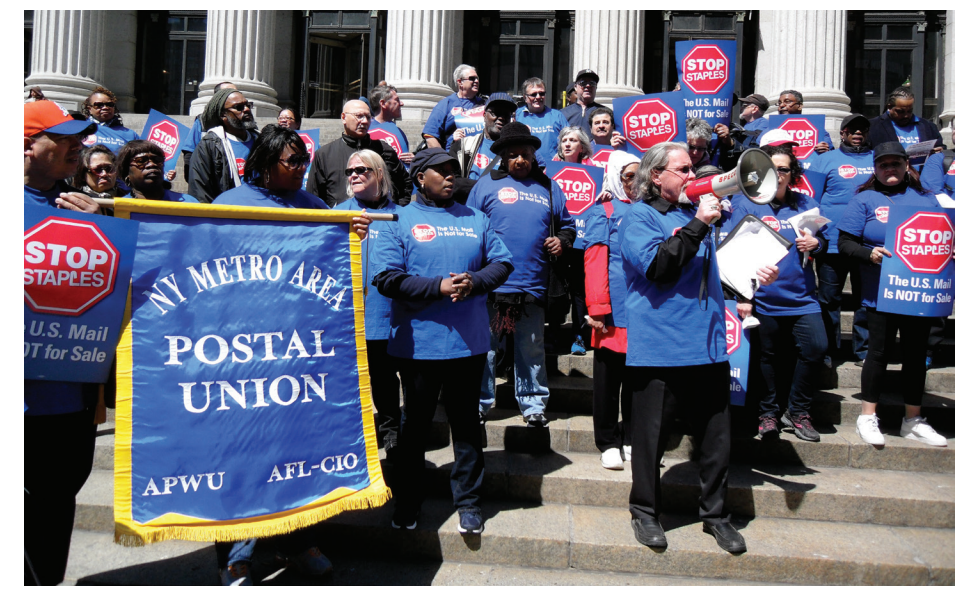
Protesting in front of the GPO in New York City. Over the course of three-years supporters held rallies across the country