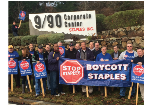
Supporters rallied in front of Staples headquarters in Framingham, MA.