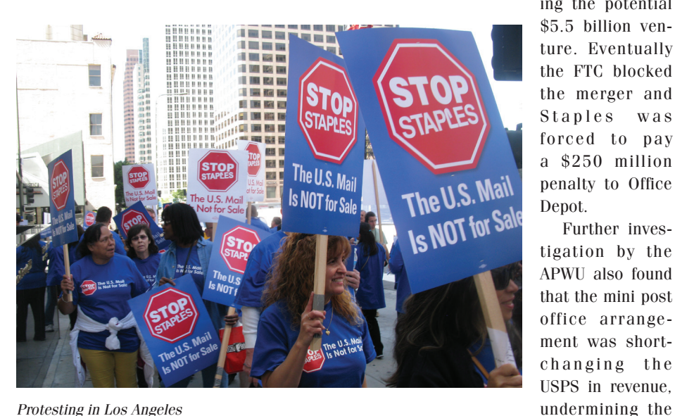
Protesting in Los Angeles